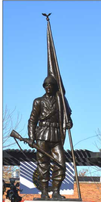
"Proud" Veterans Memorial Park

You are always welcome to contact me at my office at (435) 843-2104 or email me at dwinn@tooelecity.org .